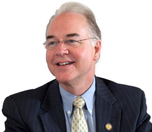
Tom Price, Nominee for HHS Secretary