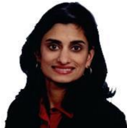
Seema Verma, Nominee for CMS Administrator